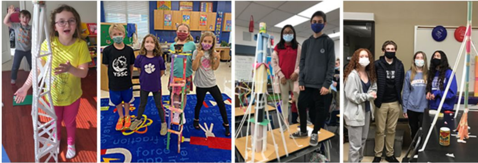
Figure 4. The Fluor Engineering Challenge is designed to be engaging and accessible for students in grades K-12.

Building the tallest tower that can hold a can of food for at least 60 seconds... using only paper and tape! There were over 6,000 entries from around the world. Madisen, a 3rd grader from Chloe is pictured below!